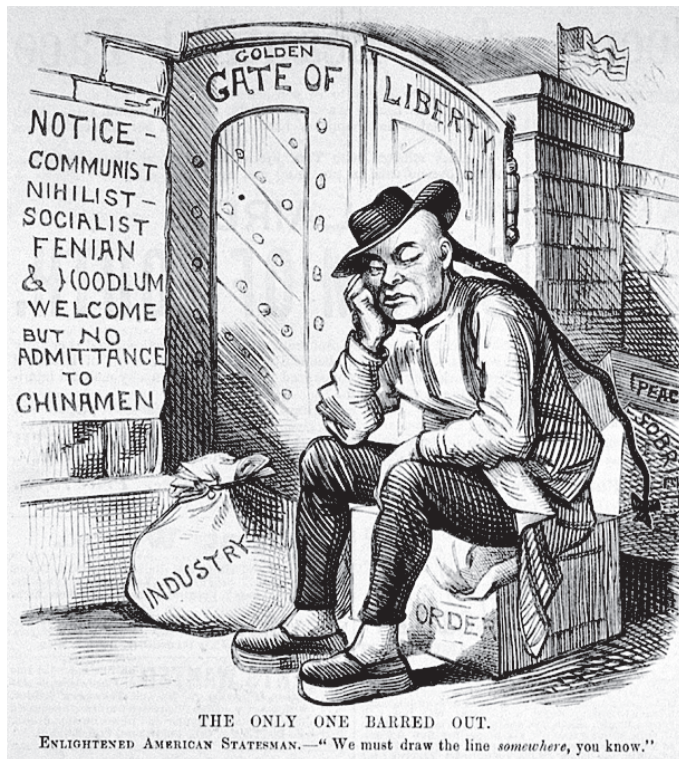
THE ONLY ONE BARRED OUT. Enlightened American Statesman. —“We must draw the line somewhere , you know.”

Questions 29–32 refer to the cartoon below.