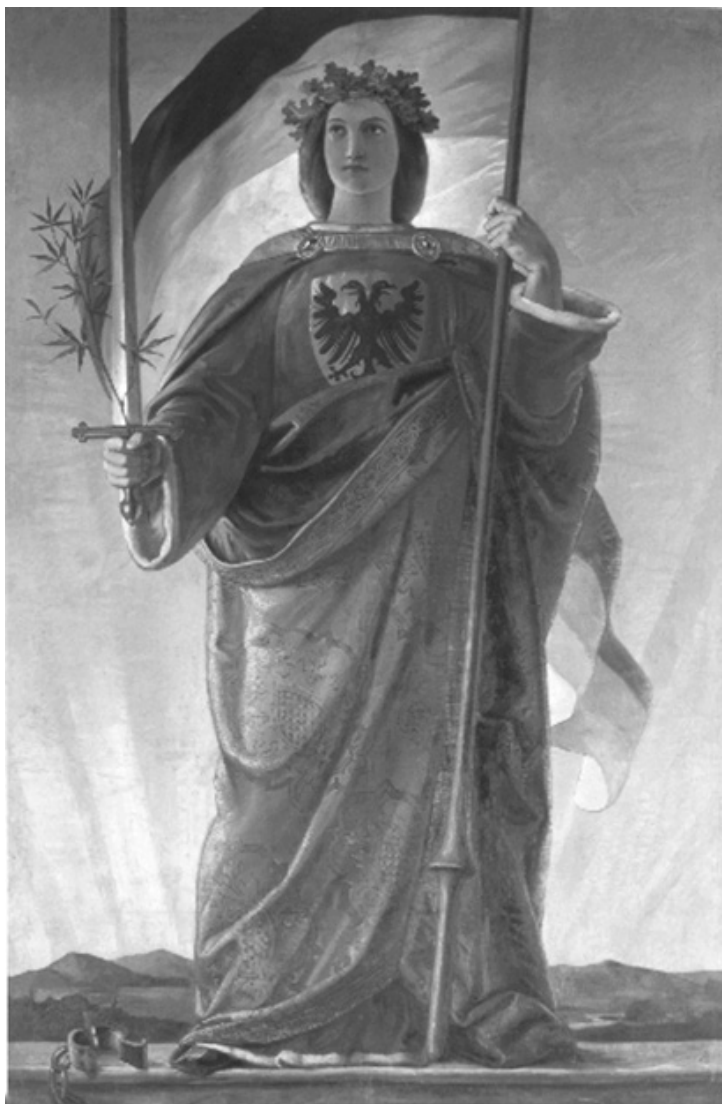
Phillip Veit, Germania , 1848

4. Use the image below to answer all parts of the question that follows.