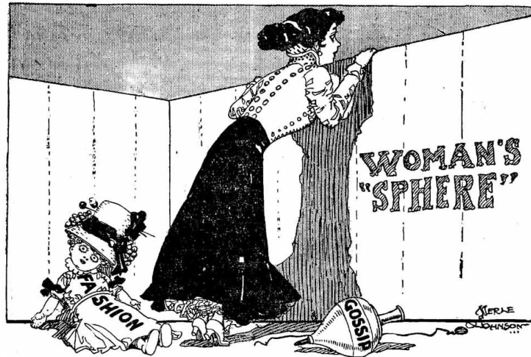
Woman Devotes Her Time to Gossip and Clothes Because She Has Nothing Else to Talk About. Give Her Broader Interests and She Will Cease to Be Vain and Frivolous.